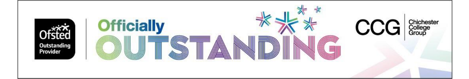
Study Programme Leader