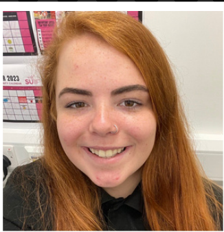
RIA VOICE STUDENT EXPERIENCE CO-ORDINATOR