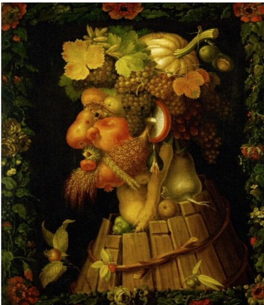
Autumn by Giuseppe Arcimboldo (1573)

http://search.ebscohost.com/login.aspx?direct=true&db=imh&AN=imh598128&site=ehost-live