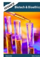
Biotech and Bioethics