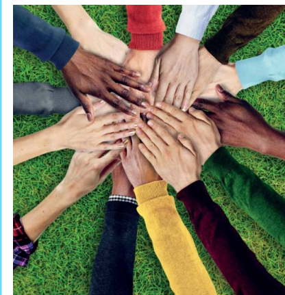
Racism, Tracy Biram Issues , Volume 376