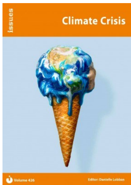
Climate Crisis, Issues, Volume 426

Including articles, ebooks, news and views, key facts, infograms and statistics, lobby group links, newspaper archives, reference sites, glossary and general research help.