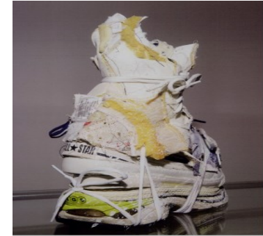
Living in a Material World