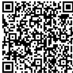
Right handed kit