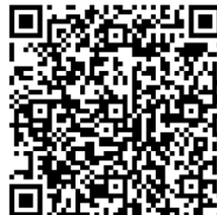
Left handed kit