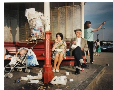
Martin Parr – Last Resort