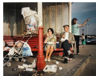
Martin Parr – Last Resort