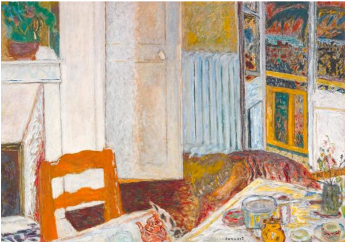
Pierre Bonnard, The White Interior , 1932