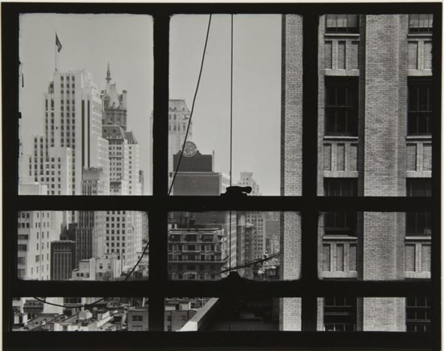
Ansel Adams, View from Window, looking North, An American Place, Gallery of Alfred Stieglitz , 1939

The theme Room with a View can be interpreted in different ways. The view can be external, looking to the outside, perhaps through a door or window. Alternatively, it can be the view inside the room. The space you choose can be very personal, such as your bedroom, or it could be a public space such as museum, train station waiting room, or library. You get to choose whether the space is personal to you, somewhere that has special meaning, or a room that is new to you.