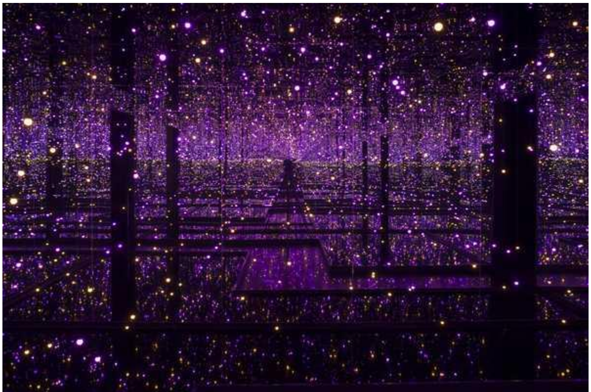
Yayoi Kusama Infinity Mirrors Exhibition 2013, Tate Modern