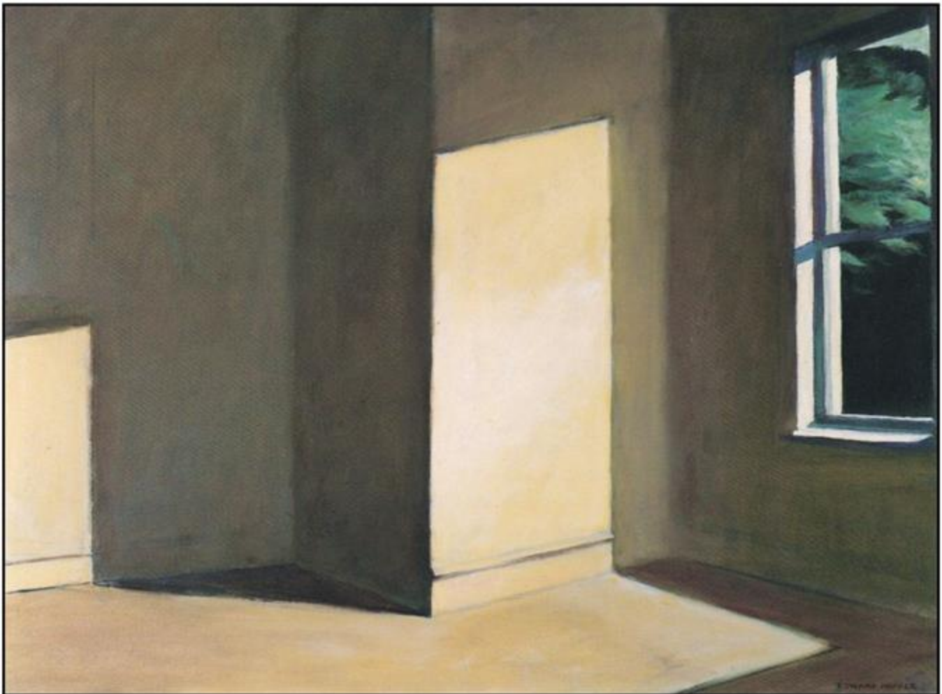
Sun in an Empty Room, 1963

Source: https://www.edwardhopper.net/sun-in-an-empty-room.jsp