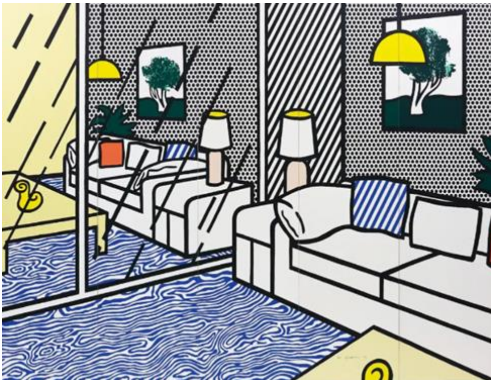
Roy Lichtenstein, Wallpaper With Blue Floor Interior , 1992