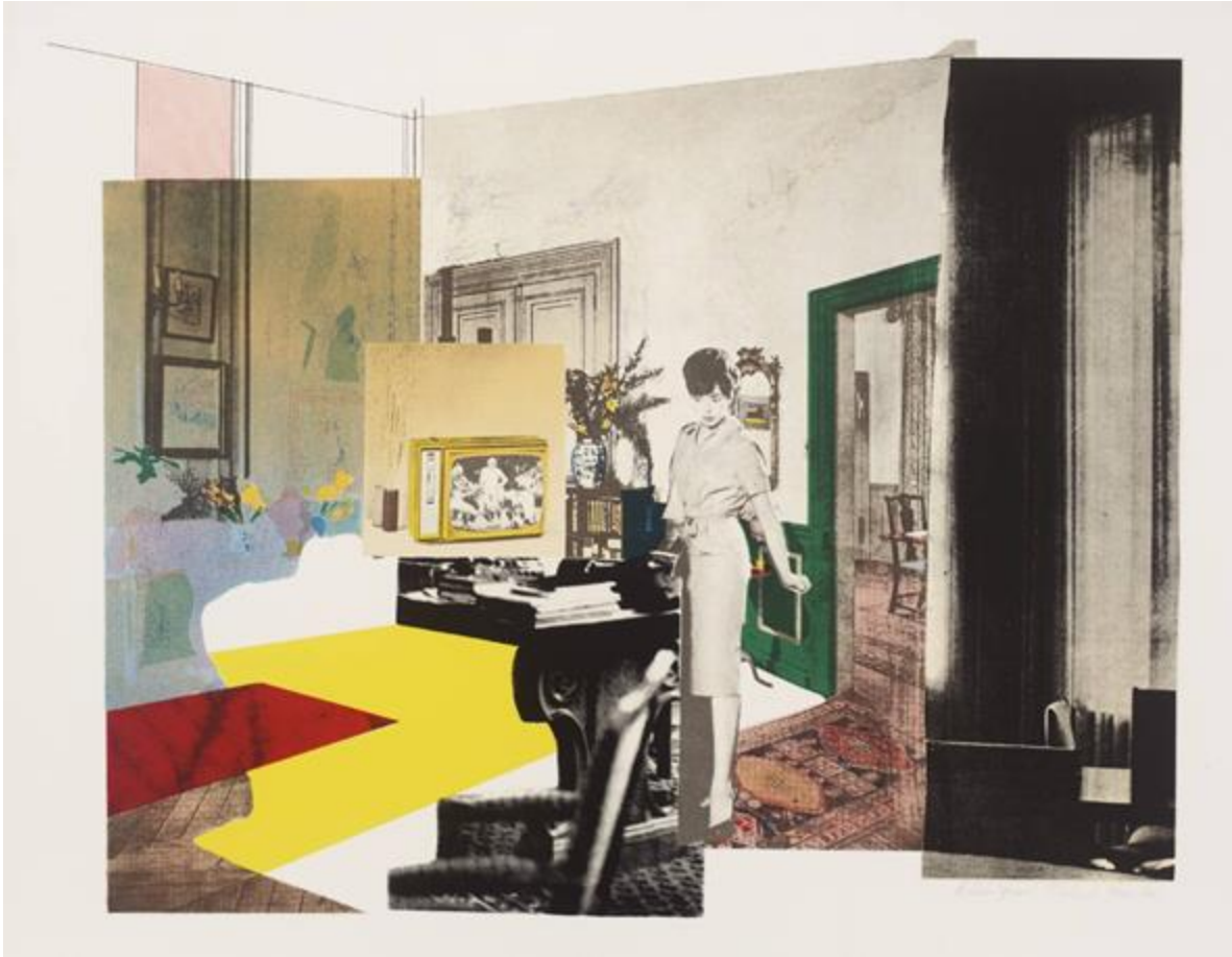
Richard Hamilton, Interior , 1964–5