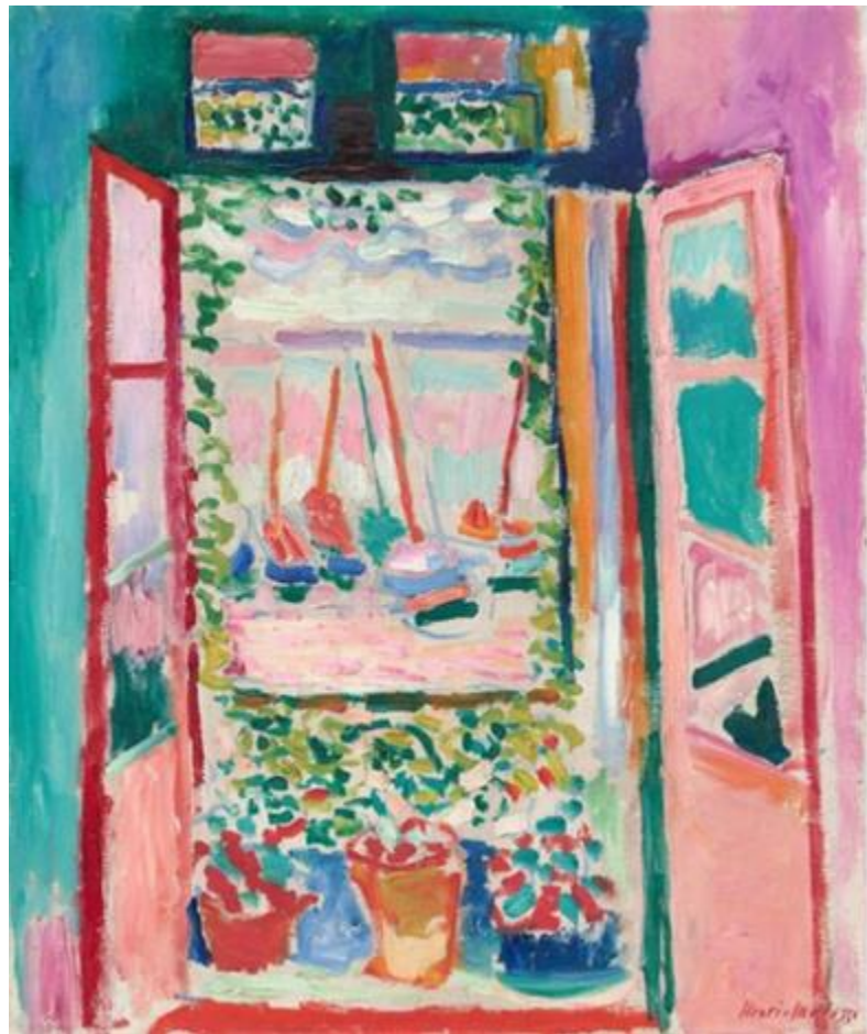
Henri Matisse Open Window, Collioure , 1905