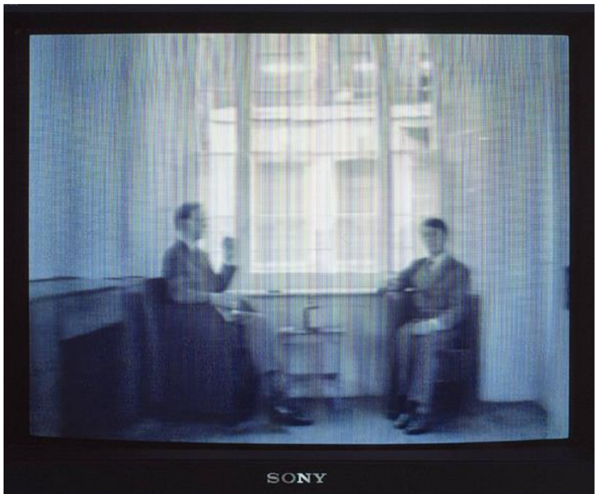
Gilbert & George

https://www.dcmooregallery.com/artists/duane-michals