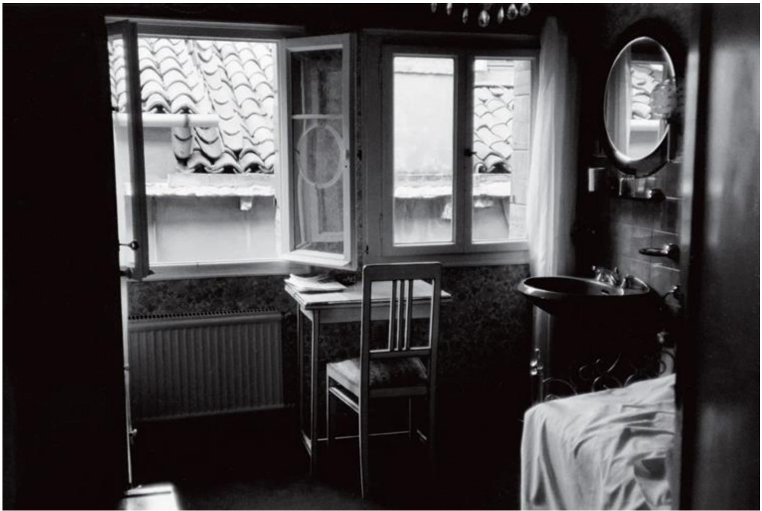
Sophie Calle Room 43. The Hotel Series.1981.

https://www.newyorker.com/books/under-review/sophie-calle-and-the-art-of-leaving-a-trace