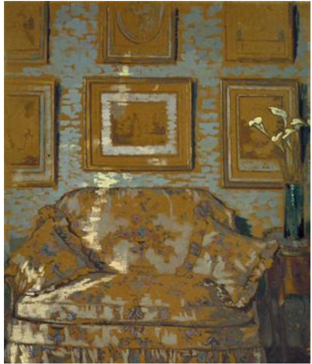
Ethel Sands The Chintz Couch c.1910-11