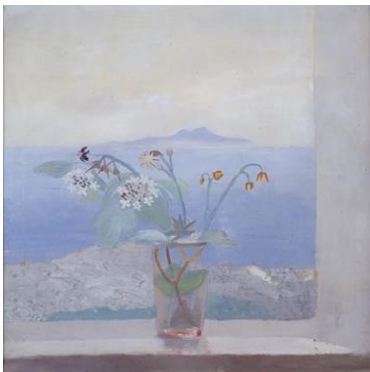
Winifred Nicholson The Isle of Man from St Bees, c. 1945