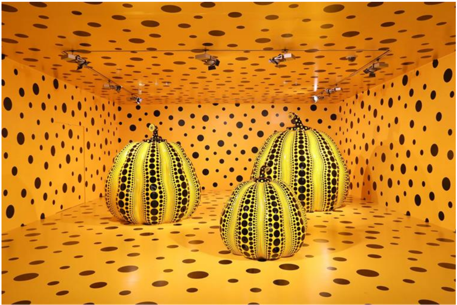
Yayoi Kusama Infinity Mirrors Exhibition 2013, Tate Modern