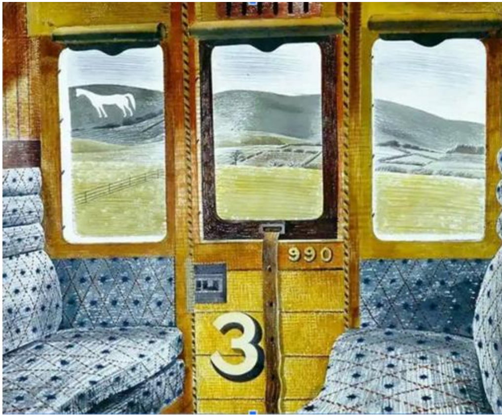
Eric Ravilious, Train Journey , 1939

Source: https://www.spectator.co.uk/article/alive-with-innovation-british-art-between-the-world-wars/