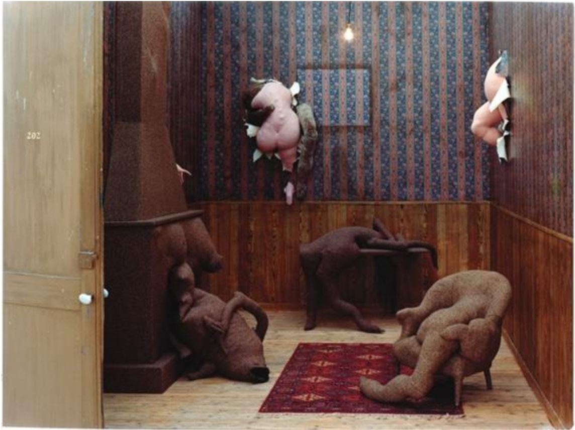
Dorothea Tanning, Poppy Hotel, Room 202 , 1970-73