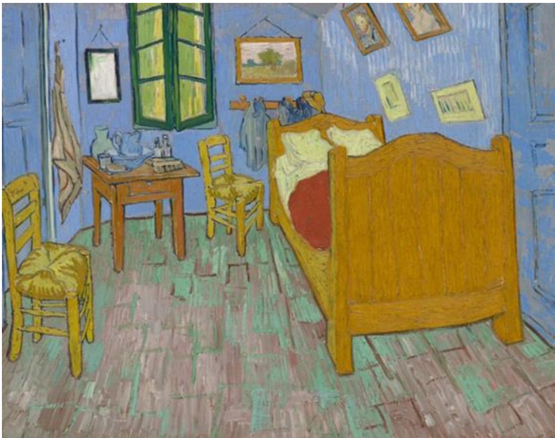
Vincent Van Gogh, The Bedroom, Arles , October 1888