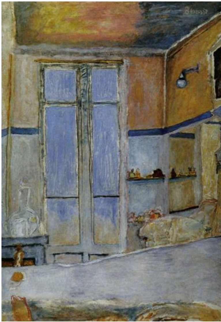
Pierre Bonnard, In the bathroom , 1940