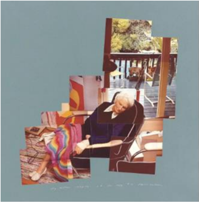
David Hockney My Mother Sleeping, Los Angeles, 1982

Source: https://www.getty.edu/art/collection/object/109MMB