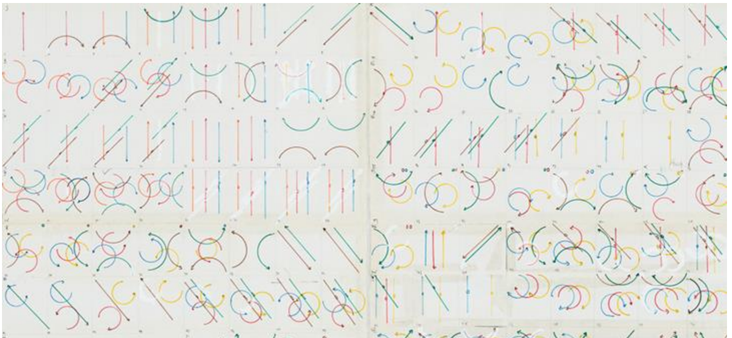
Lucinda Childs , Traces of Dance , 1963-78. Choreograph score