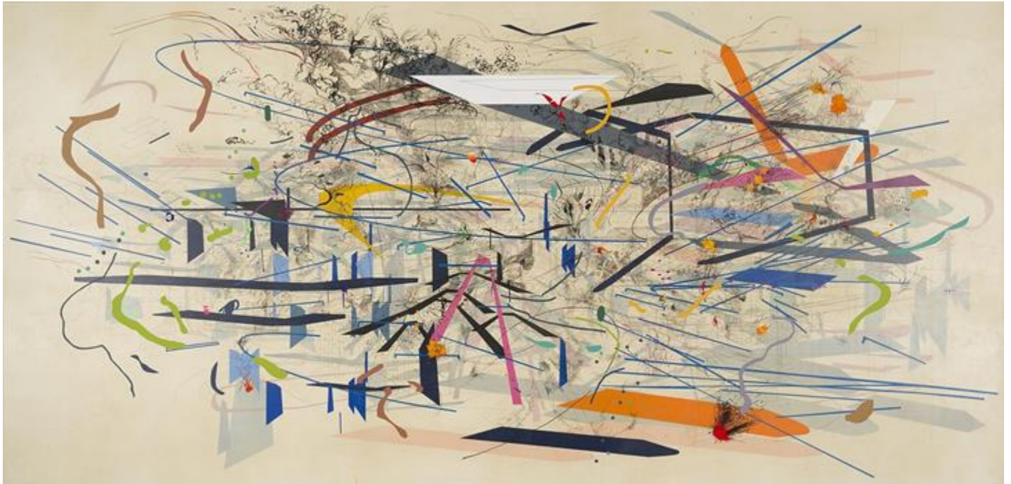
Julie Mehretu , Retopistics: A Renegade Excavation , 2001. Ink and acrylic on canvas