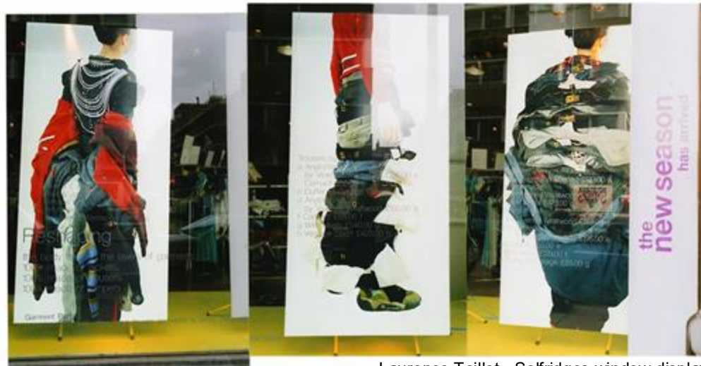
Laurence Teillet - Selfridges window display